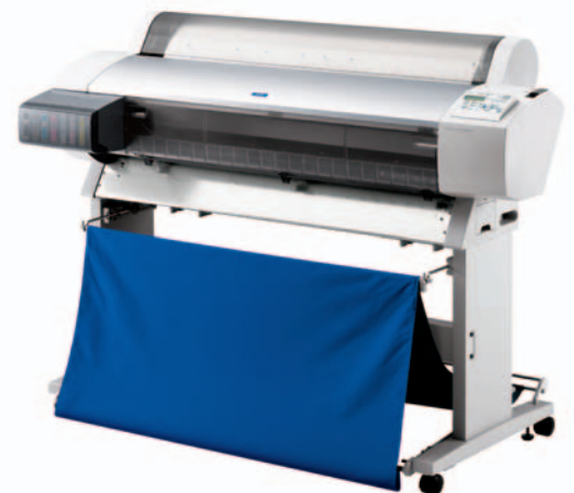
Compatible with a wide range of Epson, HP, Canon or Matchprint printers